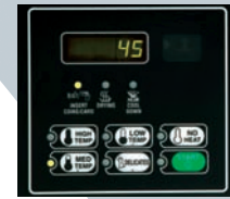
Quantum™ Dryer Control