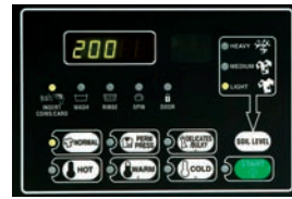
Quantum™ Washer Control