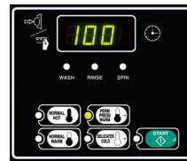
Micro-DISPLAY Control Water Saver Washer