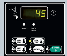
Micro-DISPLAY Control Dryer