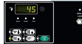
Micro-DISPLAY Control Extra-Large Tub